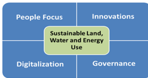
Key Policy Action Areas